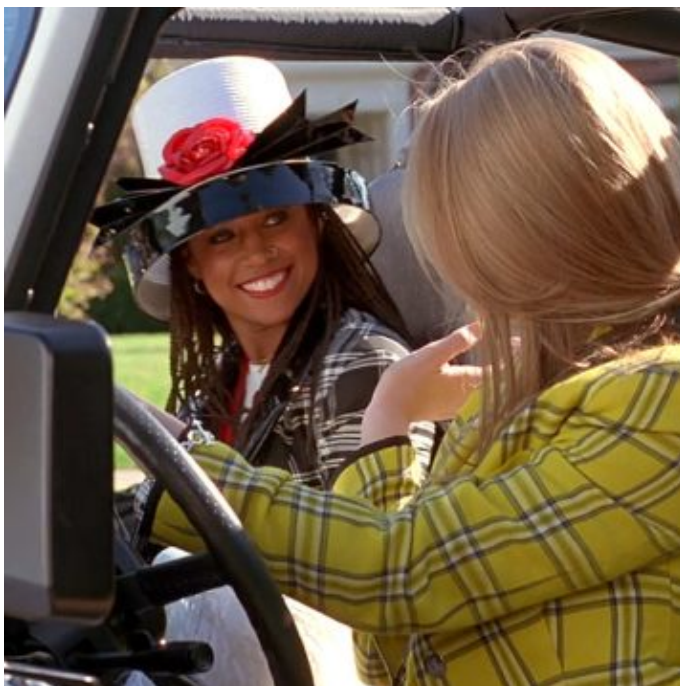
From The Movie