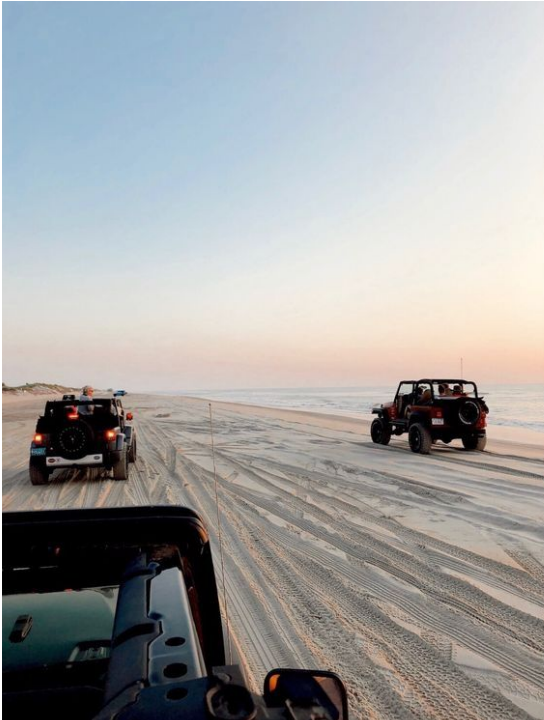
Pismo Beach