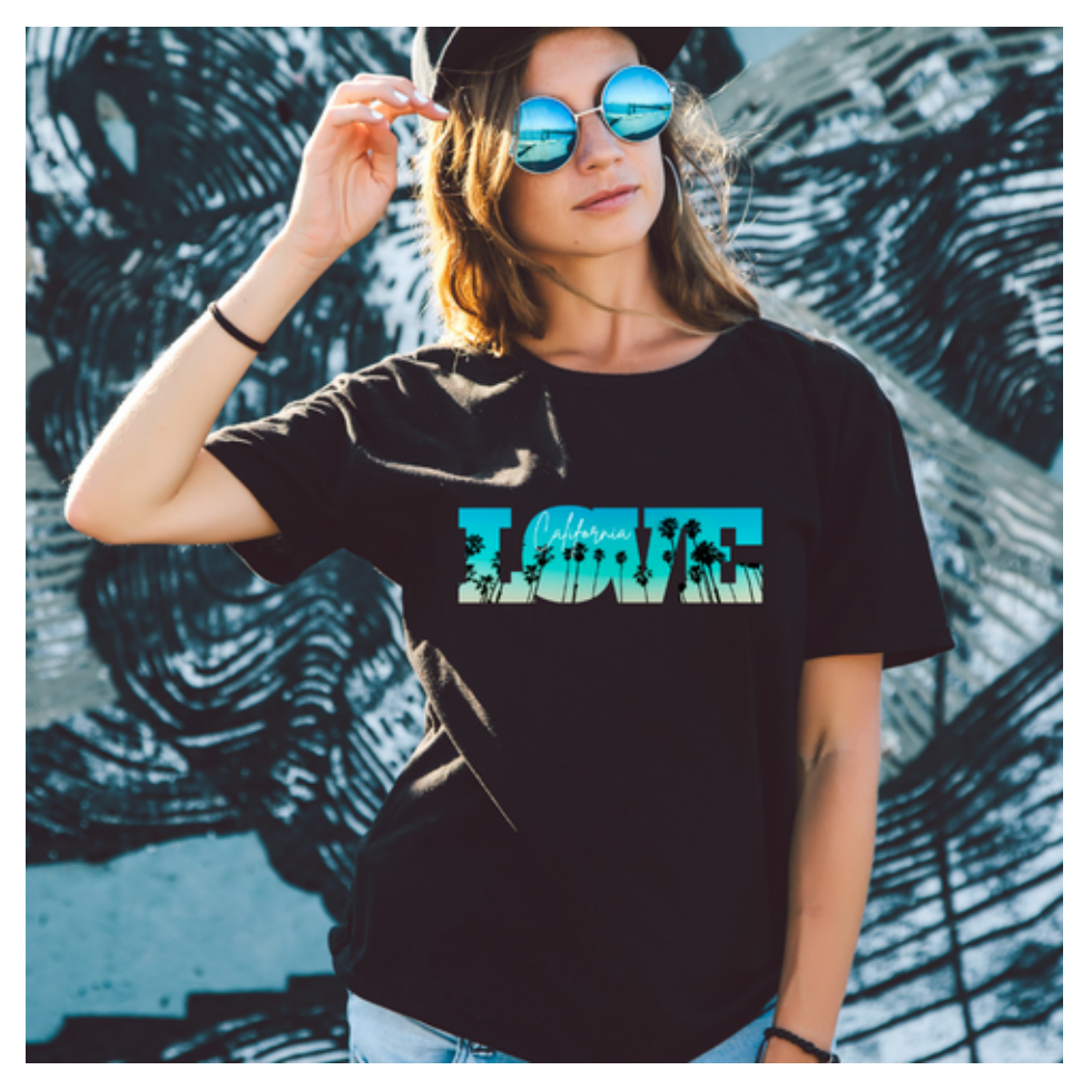
New Love California Tee